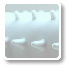
Mould belt with positioning knobs