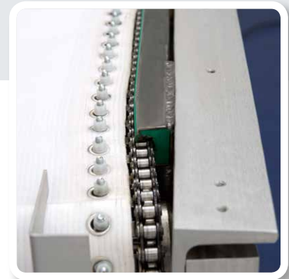
Special chain guide