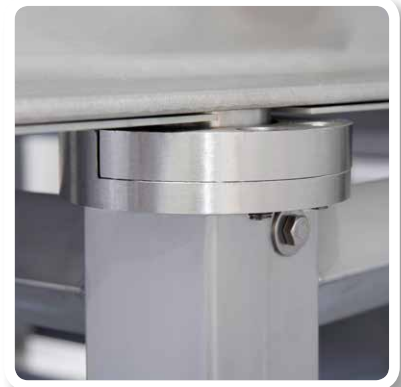
Optimised belt change